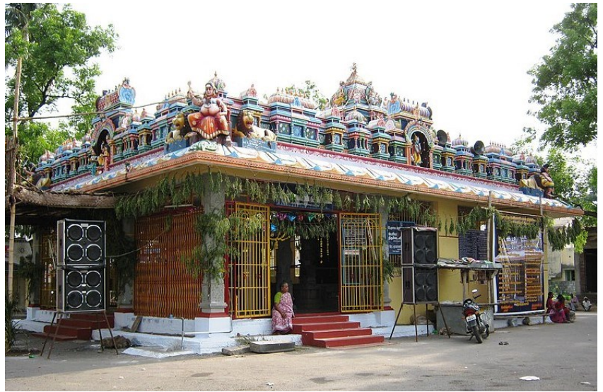
The Temple of Mariamman